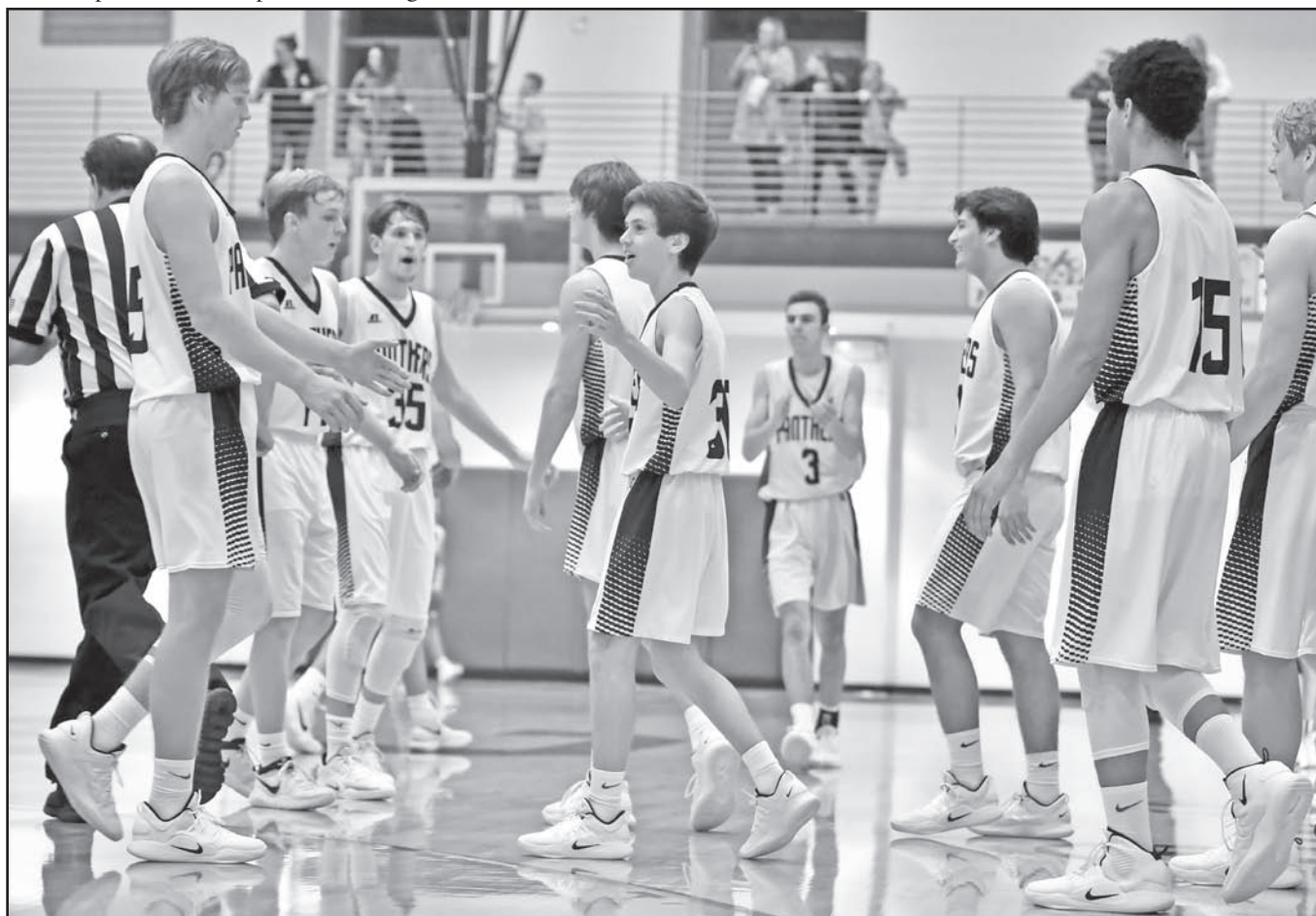
Union County players breathe a sigh of relief after surviving a late haymaker from Towns County that nearly floored the Panthers, who led by double-digits with under two minutes remaining. Union has now won 41 of the last 44 games vs Towns.

The Rebels are currently 1-1 with a 59-54 win over Pickens County -- whose football team was eliminated the night before -- and a 42-40 loss to rival Gilmer.